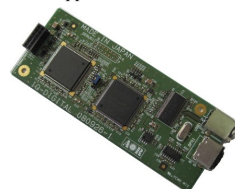
Plug-in to the AR5001D Approx. size 100 x 50mm

When an optional I/Q interface board is installed, up to 1MHz of digital I/Q output can be recorded to the hard drive of computers operating under Windows environment for later playback and analysis without any loss of quality. This feature allows for unattended logging, signal classification and signal analysis. PC Control software for Windows XP, VISAT and 7 is supplied with the board.