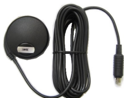
Optional GPS Receiver . Third party product. (Connect to accessory jack.)

The AR5001D is capable of using GPS pulse signal for an accurate time base for the local oscillator circuit. 0.01ppm frequency accuracy for the 10MHz internal master oscillator is obtained when synchronized to a GPS signal.